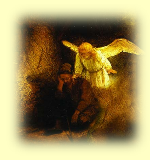
Click to continue when ready

we look forward to praying together tomorrow.