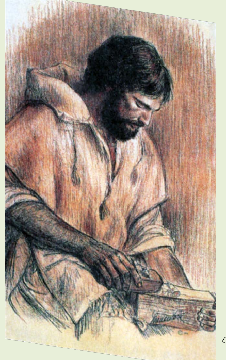
Click to continue when ready