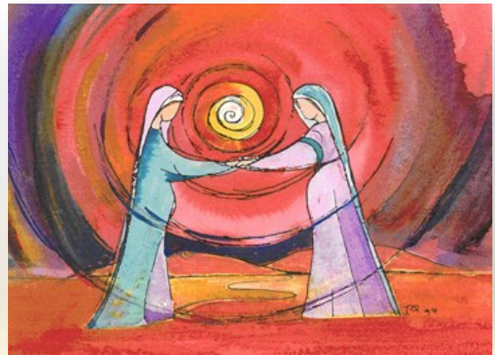
“Visitation” Therese Quinn