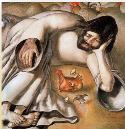
Stanley Spencer ... "as a hen gathers her brood" (Luke 13:34)