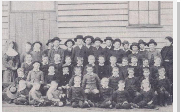
Photo from Bacchus Marsh Parish Newsletter 1980 recalling the history of the St Bernard's School

During Mother Mary's leadership of more than 40 years she founded 160 Josephite Convents, 12 homes for orphans and the homeless and 117 schools with 12,000 children.