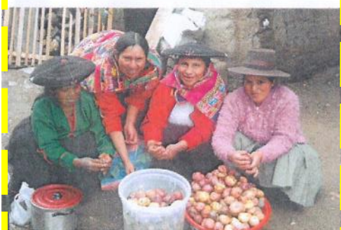
Bottom Photo: Preparing lunch for Tuck shop.