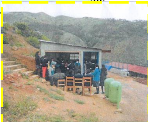
Top Photo: Fe Y Alergria School 'Tuck Shop' at Tarma.