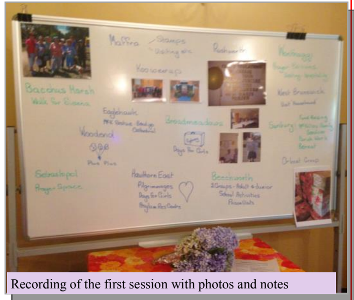
Recording of the first session with photos and notes