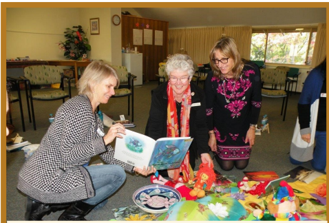
Seasons for Growth Companion Training

In addition to our usual programme we were honoured to host the AJASS - Association of Josephite Affiliated Secondary Schools 2 day Conference at the centre where Principals came from far and wide to deepen their knowledge and understanding of the Charism and what it means in 2014. They were amazed at the West Australian Josephite Journey since 1897.