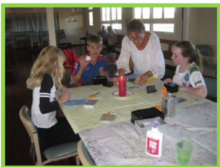
Children recording their commitments eg, I'll do my homework, tidy my room... These were put in boxes and placed in the church.