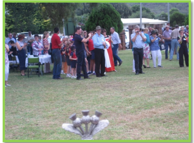
View from a vintage car.