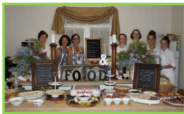
"Grazing Station" at 'Art in the Convent'.

A feature of the Centenary weekend was an art show titled "Art in the Convent" on the Saturday night with over 140 pieces exhibited in MacKillop House. Guests were delighted to view the high standard of art and roam the hallowed rooms of the fine old building which was the former Convent. A display of St Patrick's students' visual art paintings was on display in what was originally the boarders' quarters of the Convent. A delicious rustic grazing station of antipasto foods and specialty breads was on offer as well as sampling of wines. Also provided was musical entertainment from local talent who were either past students or who have or have had an association with the School.