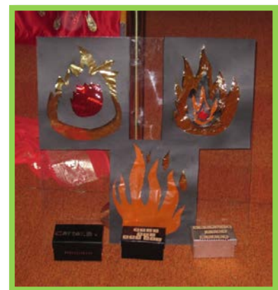
The finished 'stained glass' windows and boxes containing commitment statements.